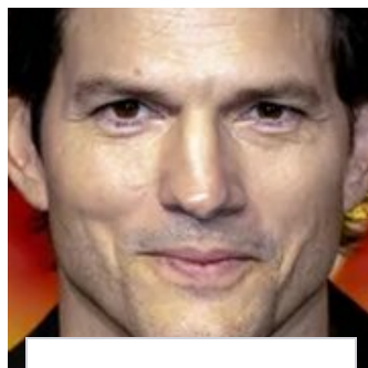
Ashton Kutcher Can't Escape The Plastic Surgery Speculation