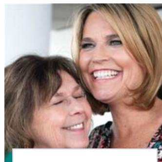
The Search For Savannah Guthrie's Missing Mom