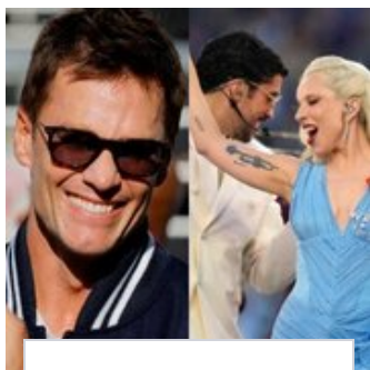
Tom Brady's Reaction To Bad Bunny's Halftime Show Says It All