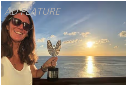
How Pride of Britain winners enjoyed a fabulous cruise holiday