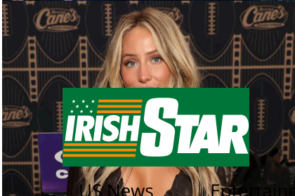
Super Bowl viewers fume 'get off my screen' as MAGA fan Alix Earle joins Halftime Show