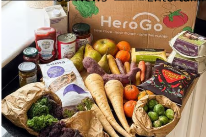
'I tried a £12 London food delivery box and it stopped my unhealthy snacking habit'

US News Entertainment Sport Newsletter Signup About Us Contact