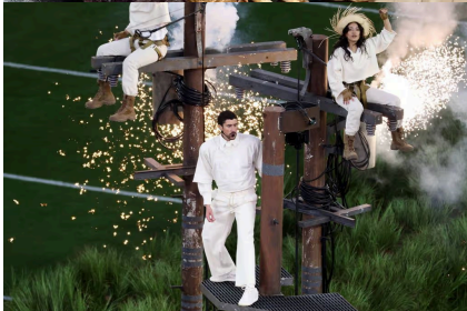
All of Bad Bunny's subtle digs at Donald Trump during Super Bowl halftime show performance