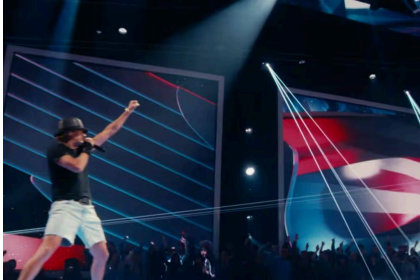
Turning Point USA halftime show disaster as ratings slide amid huge Kid Rock accusation