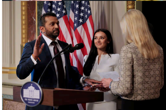
Kash Patel's girlfriend sparks MAGA backlash after promoting Bad Bunny halftime show