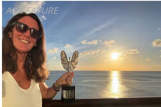
How Pride of Britain winners enjoyed a fabulous cruise holiday