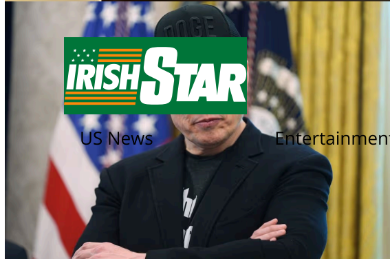
Richest man in the world Elon Musk complains his massive wealth doesn't make him happy